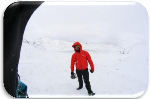
As the Scouts Say – Be Prepared